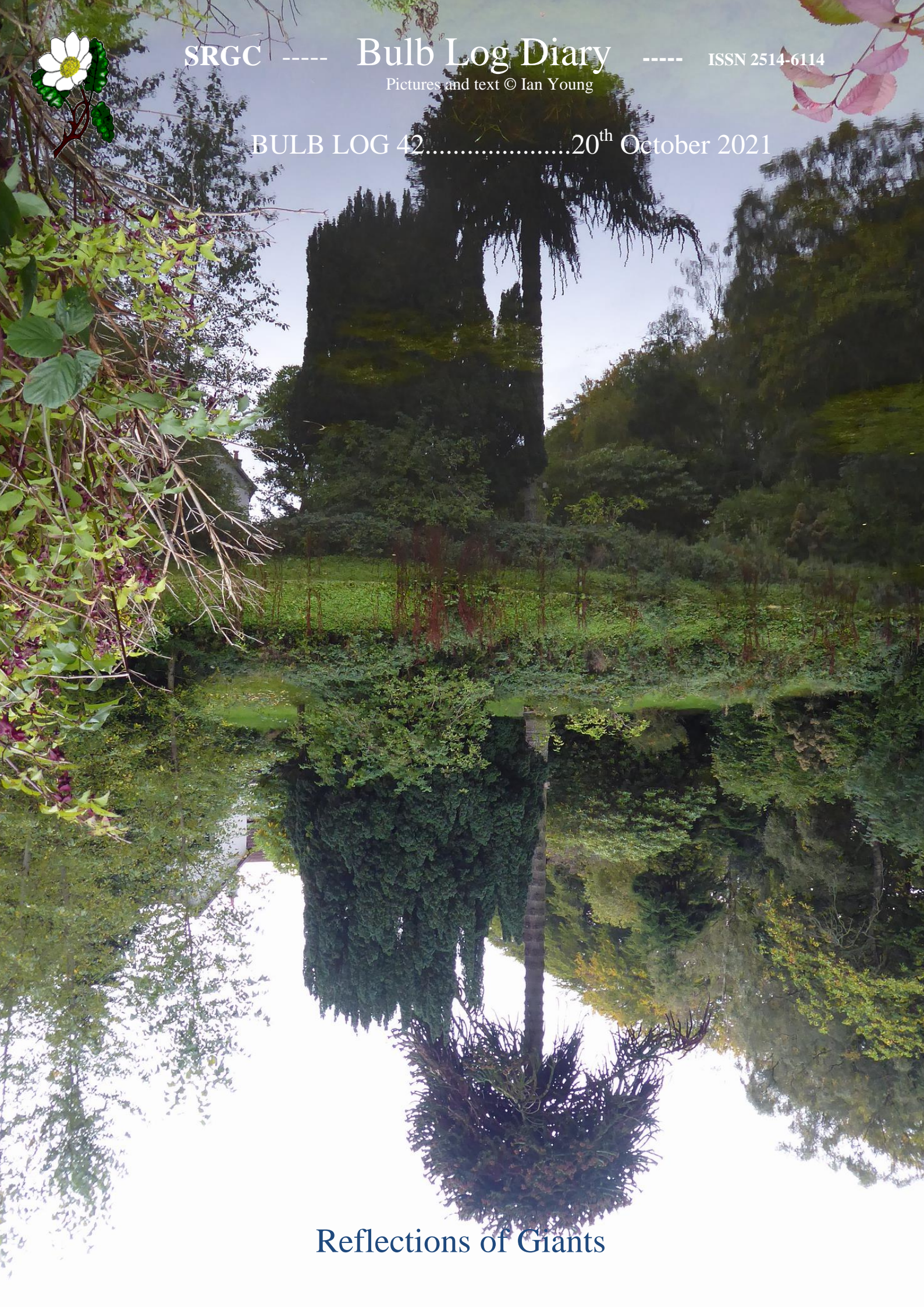
Reflections of Giants