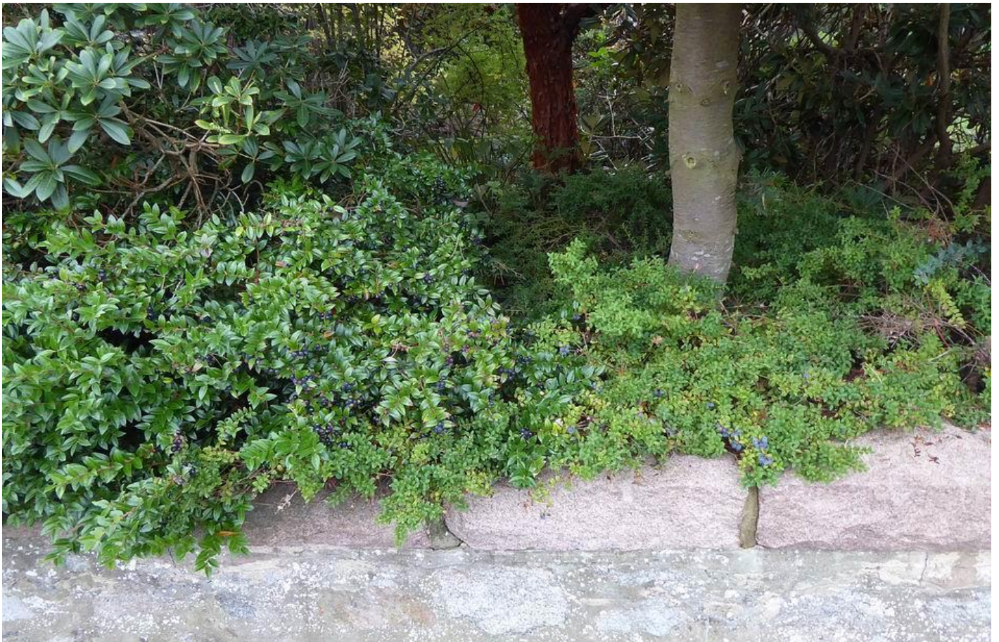
Vaccinium ovatum and Vaccinium floribundum bushes growing over the front wall.

If we get there before the birds we can harvest some tasty berries from the deciduous Vaccinium smallii , above, as well as the evergreen Vaccinium ovatum and Vaccinium floribundum shown in the following pictures.