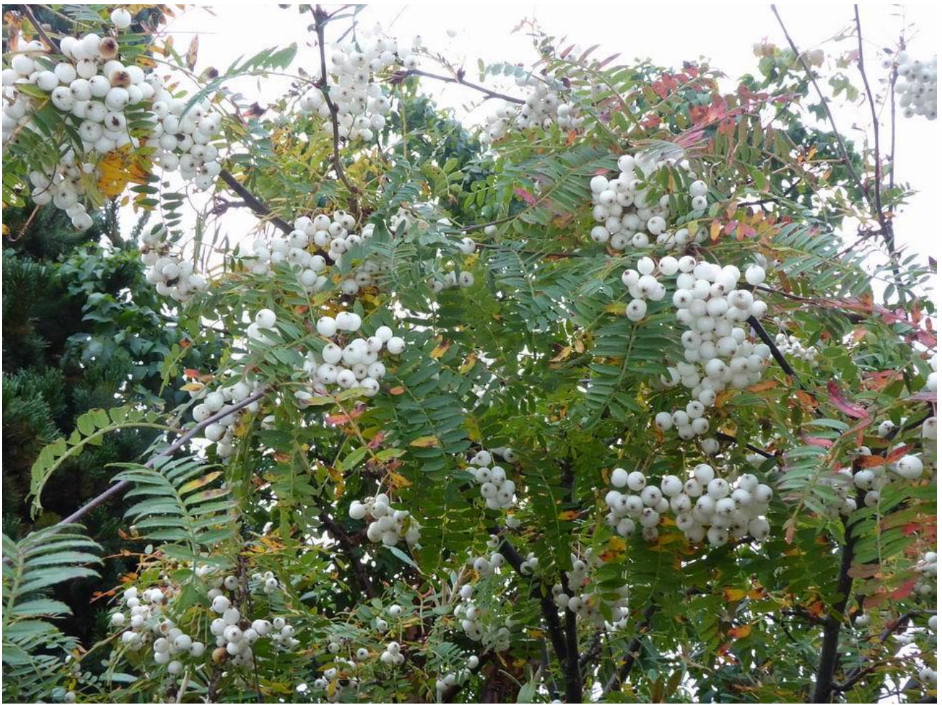
Sorbus fruticosa 'Koehneana'.

I have often seen it written that birds leave white berries until later in the season but my observations suggests the birds eat the berries in the order that they ripen, become tasty and presumably most nutritious rather than by colour. We have one tree of Sorbus aucuparia near the house that has been almost completely stripped of its berries with the birds struggling to reach the few that are remaining rather than starting to eat the plentiful easy to reach supply on another tree at the bottom of the garden see below.