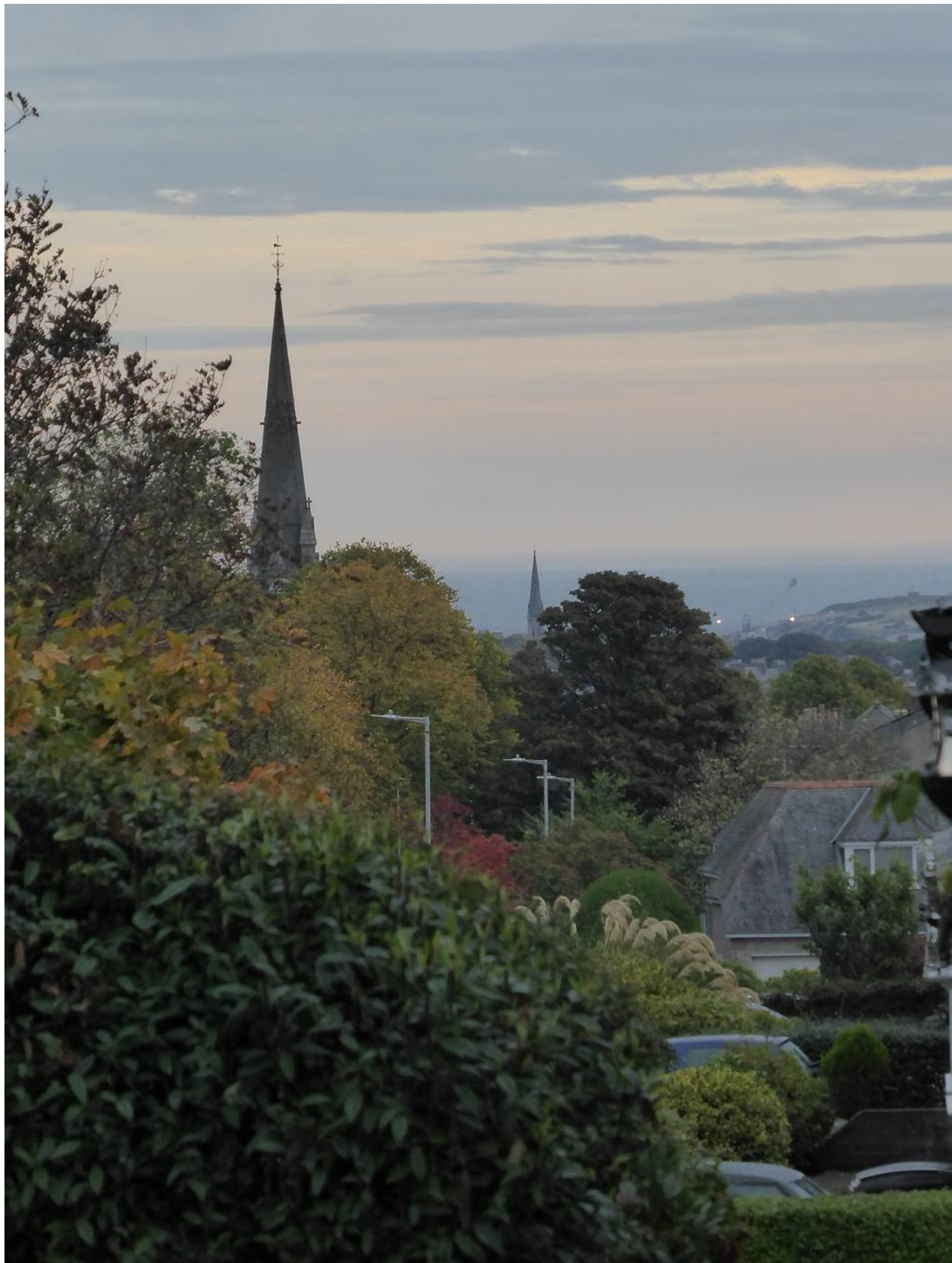
The tree rich view from our doorstep down towards the sea.

Click this link if you want to read what I wrote about the power of trees in a previous edition - Bulb Log 3121