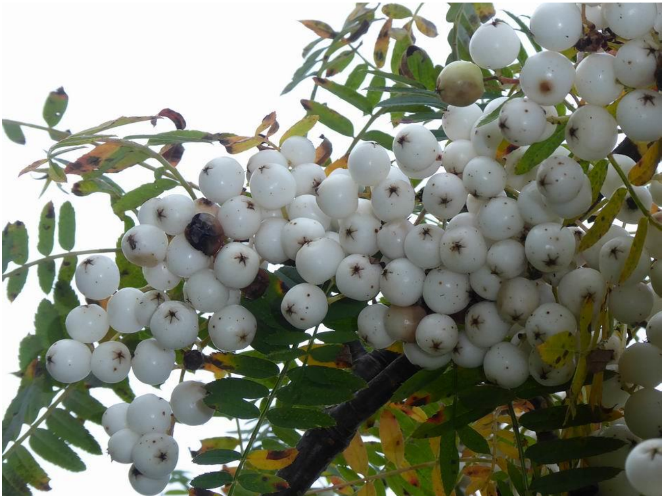
Sorbus fruticosa 'Koehneana'.

There is also a good crop of Cotoneaster berries which ripen later to provide a food source for the birds when they have eaten all the other berries such as Sorbus.