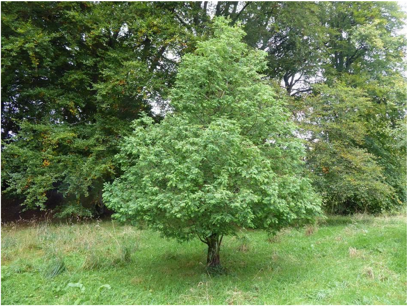
Dawn Redwood, Metasequoia glyptostroboides is native to Lichuan county in Hubei province, China